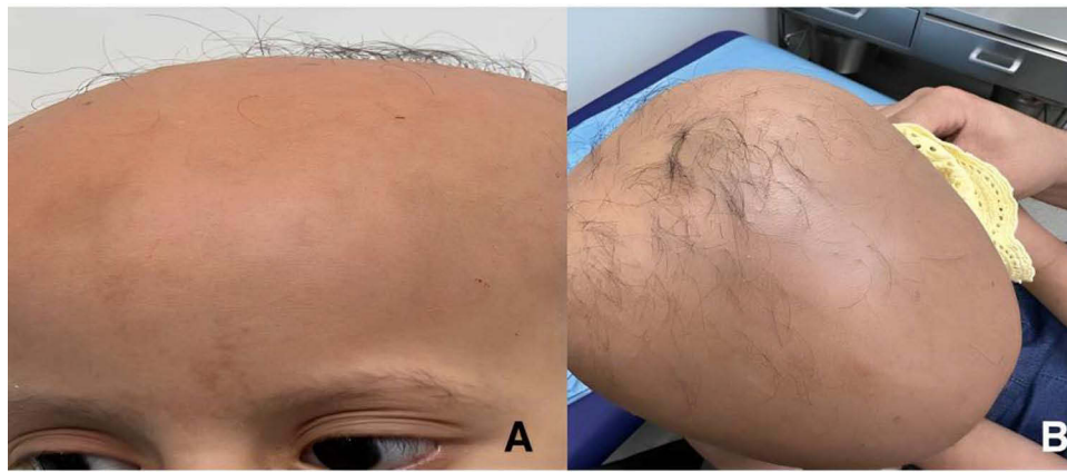
Figure 1 Diffuse alopecia with few terminal hairs. (A) Fronal view, (B) Vertex view.