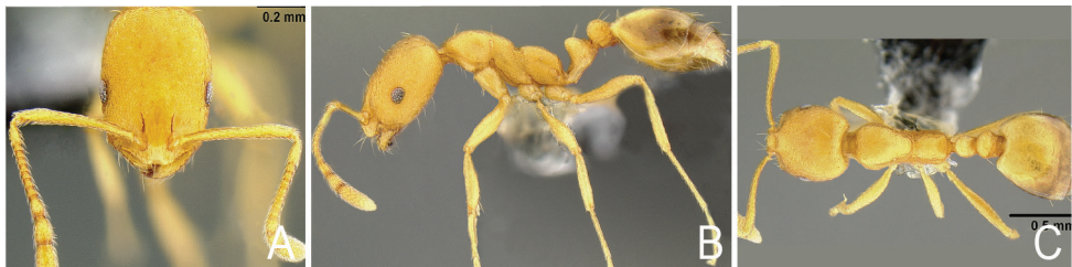
Figure 4. Monomorium pharaonis from Nampar Macing, Indonesia. Worker, CASENT0171086 A frontal view B lateral view C dorsal habitus.