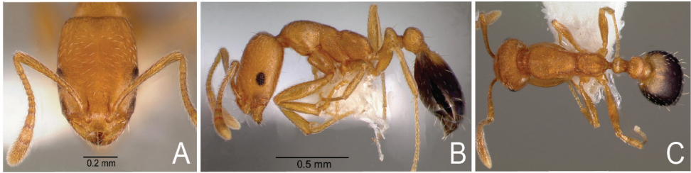
Figure 1. Monomorium sablbergi from Sacramento, USA, imported from Thailand. Worker, CASENT0005783 A frontal view B lateral view C dorsal habitus.