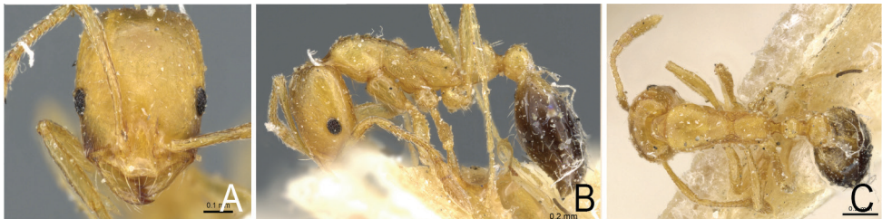
Figure 3. Monomorium sablbergi , syntype from Jericho, Palestine. Worker, CASENT0904576 A frontal view B lateral view C dorsal habitus.