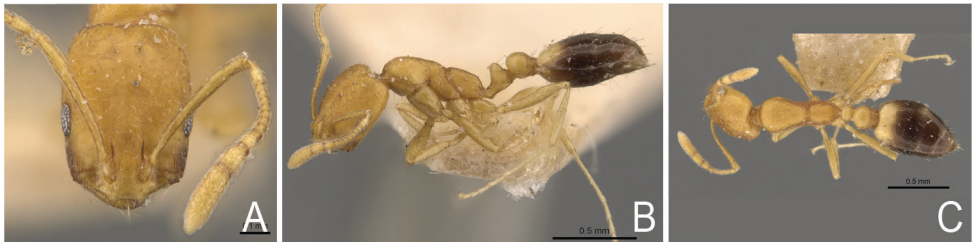
Figure 2. Monomorium dichroum , syntype from Mumbai, India. Worker, CASENT0908718 A frontal view B lateral view C dorsal habitus.