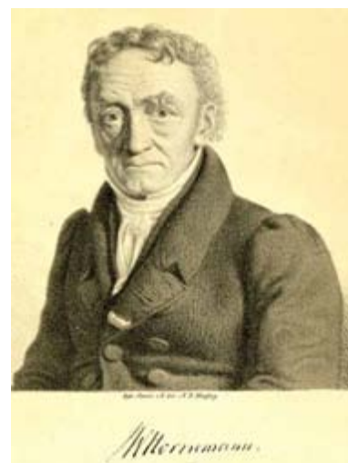
Fig. 3. Jens Wilken Hornemann (1770–1841), Danish botanist, editor of Flora Danica and collaborator with Fries.

and again in 1877 (Fries 1877; again in Latin), and again in 1955 (Fries & Fries 1955; in English, as part of the 50-year celebration of the Danish Mycological Society). Numerous sketches and portraits of Fries have been executed (Fig. 1). 2