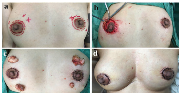
Figure 1 Surgical procedure of modified double ring areola incision for multicentric breast benign tumor. (a) Tumor location, (b) tumor separation and removal, (c) postoperation, and (d) two days postoperation.

The operation and drainage durations in the two groups were not significantly different for unilateral or bilateral lesions ( P > 0.05 ); however, the intraoperative blood loss