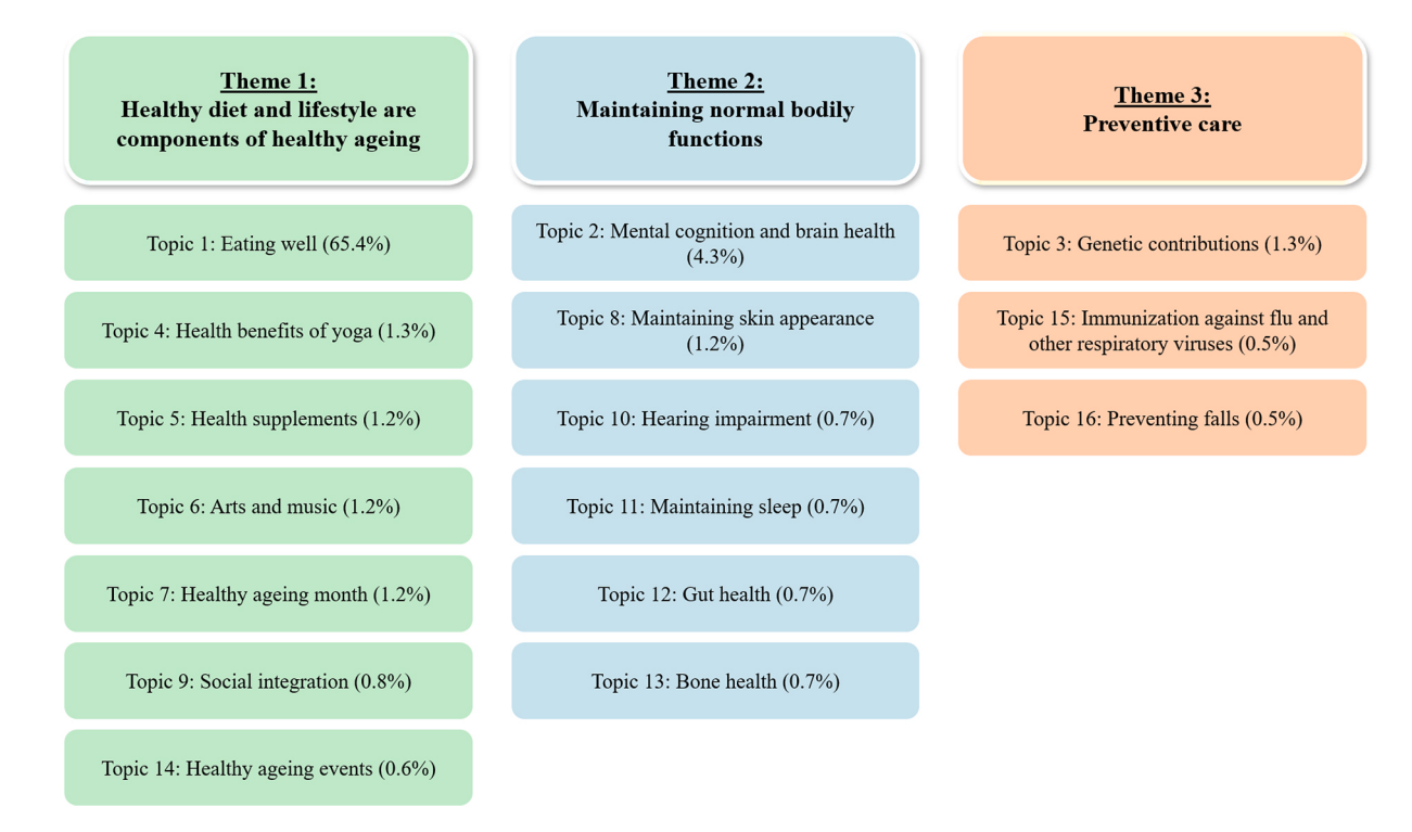
Fig. 3. Classification of themes and topics uncovered in the present study (percentages represent the prevalence of the individual topics).

highlighted by prior studies [26,27], and contributes towards personal satisfaction with one's looks and improved self-esteem [28]. The systemic factors of immunizations and fall prevention are also in line with WHO's interpretation of healthy ageing. Annual vaccinations for flu and other respiratory viruses (Topic 15) help to strengthen the immunity of older adults, protecting them against severe illnesses and complications. Fall prevention (Topic 16) protects against injury and is vital in protecting the health of older adults, as a single fall may cause a hip fracture and seriously threaten the independence, morbidity and mortality of an elderly [29]. Both immunizations and fall prevention are relevant for older adults to stay in good physical health, enabling them to participate in activities they find value in. All these elements are encapsulated in the early definition of successful ageing as laid out by Rowe and Khan, which has three main components: low probability of disease and disease-related disability, high cognitive and physical functional capacity, and active engagement with life [30].