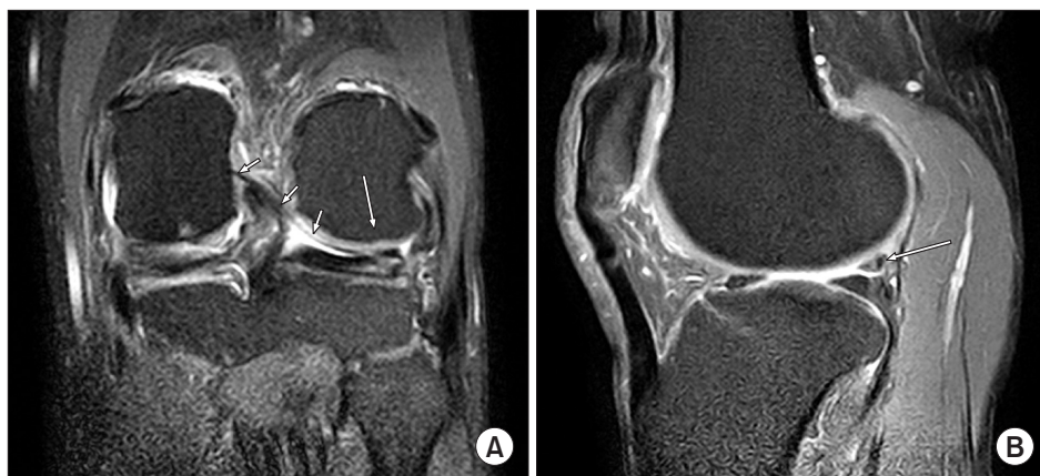
Fig. 3. (A) The ligament of Humphrey (anterior menisiofemoral ligament) was observed as a thin, linear band, with low-signal intensity on coronal magnetic resonance imaging (short arrows). (A, B) High-intensity signal extending to the ligament of Humphrey mimicking a tear of the lateral meniscus (long arrows).

So arthroscopy surgeons should take menisiofemoral ligaments into consideration and pay close attention to the confusing radiological features when encountering patients with meniscal tears. In addition, it is advised to inform the patients of the possibility of the presence of menisiofemoral ligaments before surgery.