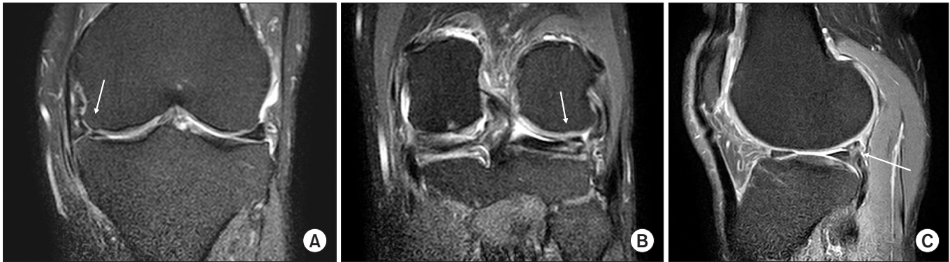
Fig. 1. Coronal proton density spectral presaturation inversion recovery magnetic resonance imaging scans showing high-intensity signal that resembles a tear of the medial (A) and lateral (B, C) menisci, respectively.