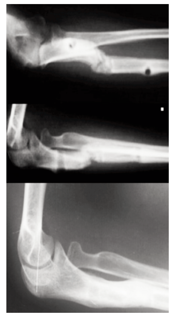
Fig. 2: Radiograph at 3 months follow-up. Reduced radial head and osteotomy site united. At one year follow-up, radial head remain reduced.

At three months post-surgery, the lengthening bone gap consolidated. The external fixator was removed and an above elbow backslab was applied for another month. After removal of the cast, all wounds had healed. Clinically, cubital valgus had reduced to 10 degrees, the ranges of motion were full for both supination/pronation and flexion/extension. Radiographs of left elbow showed reduced radial head and corticotomy site consolidated (Fig. 2). At one year follow-up, radial head remained well reduced and stable in all ranges of elbow motion.