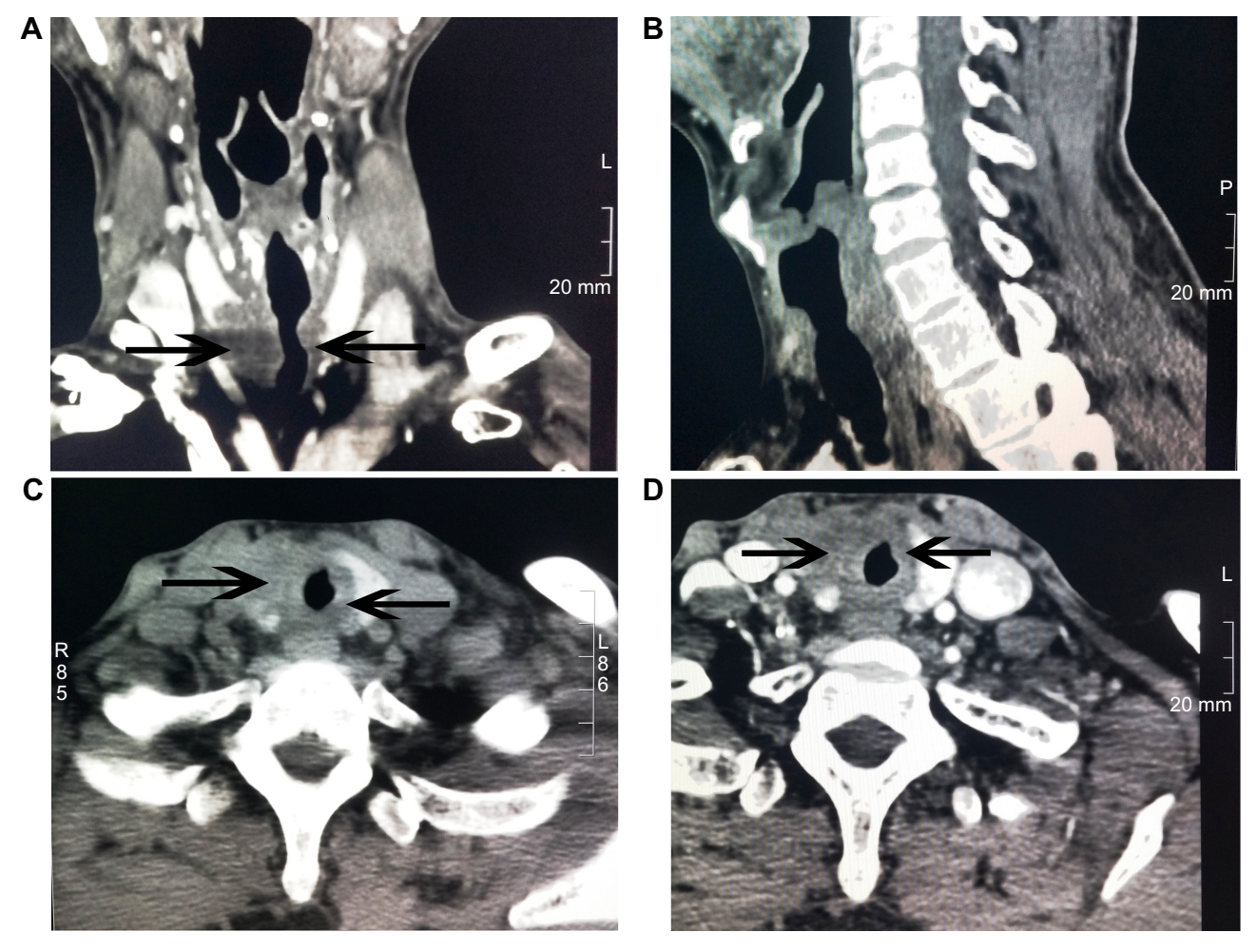
Figure I CT images of the trachea and thyroid. Notes: (A) A plain CT scan of the trachea shows tracheal compression and displacement. (B) The tumor did not invade the glottis. (C) A plain thyroid CT scan reveals multiple bilateral thyroid nodules. (D) An enhanced thyroid CT scan displays thyroid nodules that are enhanced slightly. Abbreviations: CT, computed tomography; HU, Hounsfield units.

mass resections after a discussion with the family. Pathology showed that the tumor tissue had no capsule formation and grew in an infiltrative manner, invading the surrounding thyroid follicles. Tumor cells were cribriform or tubular, and they were distributed in a solid funicular pattern. The masses consisted of double-layer structures, with glandular epithelium as the inner layer and basal cells forming the outer layer. The cribriform structure was composed of differentially sized scattered or integrated smooth cellular islands, with a central, round space filled with slightly basophilic mucoid material (Figure 2B). There was little cell atypia, and mitosis was rare. Interstitial hyalinization was present, but no obvious nerve infiltration was seen. Postoperative immunohistochemistry showed that the ductal epithelial cells were positive for pan-cytokeratin (CK), CK7 (Figure 2C), and CD117 (Figure 2D). The myoepithelial cells were positive for vimentin, S-100, P40 (Figure 2E),