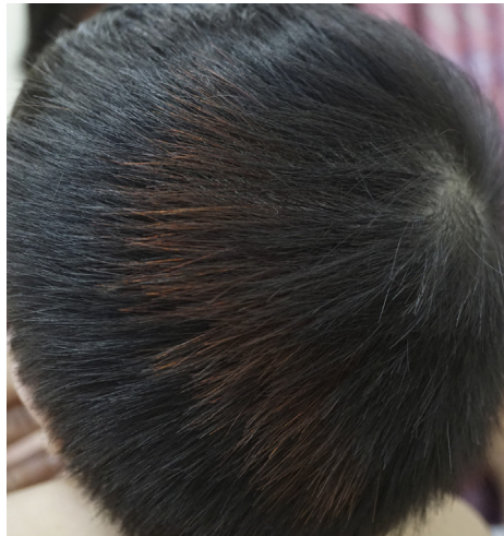
Fig 1. Photograph of left parieto-occipital scalp shows a patch of red hair following a line of Blaschko.