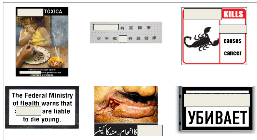
Fig. 1 Examples of current health warning labels featured on cigarette packages, as examined in this study ( Top row: Brazil, China, India; Bottom row: Nigeria, Pakistan, and Russia). As shown, we blanked out any words related to smoking or tobacco when we showed these warnings to the participating children