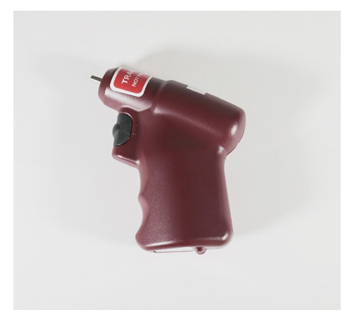
Figure 1 - Power Drill Intraosseous Device

needle. In addition, a longer (45 mm) needle is typically needed on this site. Figure 2 demonstrates the 15-gauge IO needles, which are available in 15 mm, 25 mm and 45 mm lengths.