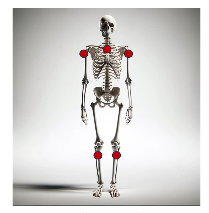
Figure 3 Common sites of intraosseous access for adult patients.

In a study of emergency department staff, 80.8% of whom have never placed an IO needle, Levitan et al demonstrated that 97.3% of insertions were successful after a short training program incorporating a 5 min video and cadaveric instruction.<sup>6</sup> Similarly, in a prospective multicenter trial of prehospital clinicians (paramedics and nurses), Anderson et al showed that a 1-hour standardized training session followed by hands-on supervised simulation allowed for the successful implementation of IO access in the field, with an 87% success rate.<sup>7</sup> This simplicity of training allows for versatile use of IO access in all acute-care areas prehospital and in-hospital.