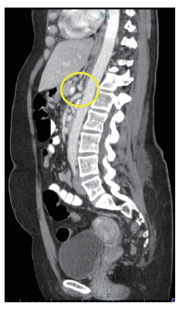
Figure 3. CT of abdomen/pelvis 6 months prior showing patent CA and SMA as they branch from the abdominal aorta (yellow circle). CT: computed tomography; CA: celiac artery; SMA: superior mesenteric artery.

ing antineutrophil cytoplasmic antibodies, cryoglobulins, complements, serum protein electrophoresis and immunofixation, urine immunofixation, antinuclear antibody, and rheumatoid factor, was all negative. Similarly, hypercoagulable workup, which included lupus anticoagulant, beta-2 glycoprotein, anticardiolipin antibodies, prothrombin, factor V Leiden, protein C and S mutation, and hepatitis panel was negative. The patient's arterial thrombosis was attributed to her CP.