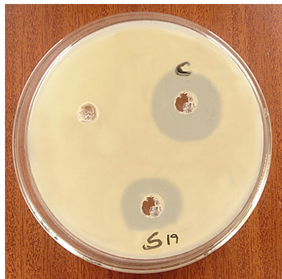
Fig. 2 Antibacterial activity of EPS nanoparticles in cream against sample 19 (S19) at 39\text{ }\mu\text{g/mL} concentration [Control (C)—tetracycline]; (no name—chitosan + cream)

The antibacterial activity of EPS nanoparticles against S19 strain was performed by checking varying concentrations. The EPS nanoparticles were effective against P. acnes at a concentration of 39\text{ }\mu\text{g/mL} , and the zone of inhibition was measured as 18 mm (Fig. 2). Cream with and without chitosan did not show any activity against the organism. After 2 weeks, the EPS nanoparticles were found to be quite stable in a cream emulsion. It was observed that the zone diameter measured for the activity of EPS nanoparticles emulsified in cream was more or less same as that of solitary EPS nanoparticles (18 and 18.5 mm against S19, respectively). This proves that EPS nanoparticles are stable in emulsions. The antibiotic tetracycline was also effective against the organism, with a zone diameter of 24 mm (Fig. 2). However, literature suggests that the organism has shown resistance to such antibiotics (Simonart et al. 2008; Andriessen and Lynde 2014). A novel