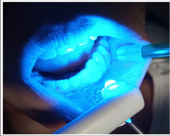
Figure 4. Activation of the light.