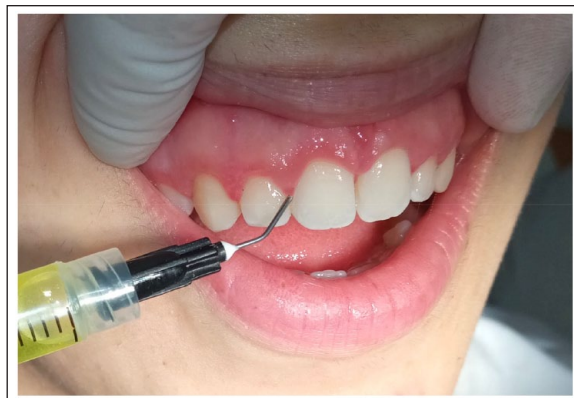
Figure 3. Application of the photosensitizer.