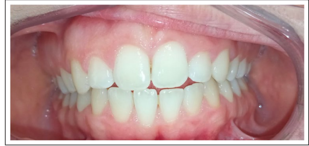
Figure 5. Clinical condition after photodynamic therapy in frontal view.

The patient improved markedly after only one cycle of PDT. There was an absence of clinically-detectable inflammation, edema, and rubor of the involved dental papillae (Figures 5 and 6). At the 4, 6, and 12 week follow-ups there were no recurrences. A noteworthy aspect is that the patient was not subjected to any oral hygiene practices in the outpatient setting and therefore the therapeutic effects are entirely attributable to PDT.