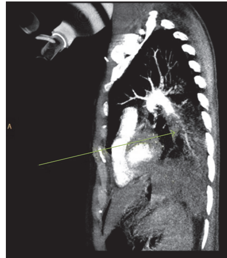
FIGURE 3: Left parasagittal contrast enhanced computed tomography pulmonary angiography. The arrow points to a large filling defect (pulmonary embolus) in the left pulmonary artery.

endotracheal tube placement, he was noted to have significant swelling of his entire right lower limb (Figure 1). A right sided iliofemoral DVT and dilatation of the right ventricle were demonstrated on point of care ultrasound assessment that had been performed in the ED. Thrombolytic therapy with alteplase (Actilase®, Boehringer Ingelheim Pharma GmbH & Co, Germany), 100 mg (10 mg over 1 minute and then 90 mg over 2 hours), was promptly initiated whilst high quality CPR was continued. A return of spontaneous circulation (ROSC) was achieved approximately 30 minutes later. The patient remained haemodynamically stable and was sent to the radiology department for a computed tomography pulmonary angiogram (CTPA) after completion of the alteplase infusion. The diagnosis of PE was confirmed on CTPA, which demonstrated multiple large filling defects in both main pulmonary arteries as well as regions of pulmonary oligoemia. An area of hyperdensity in the posterior right lung region, suggestive of an intra-alveolar haemorrhage, was also noted on CTPA as well as on the post-thrombolysis but not the pre-thrombolysis chest X-ray films (Figures 2 and 3). Since this did not result in any haemodynamic or ventilatory instability, it was decided to manage the intra-alveolar