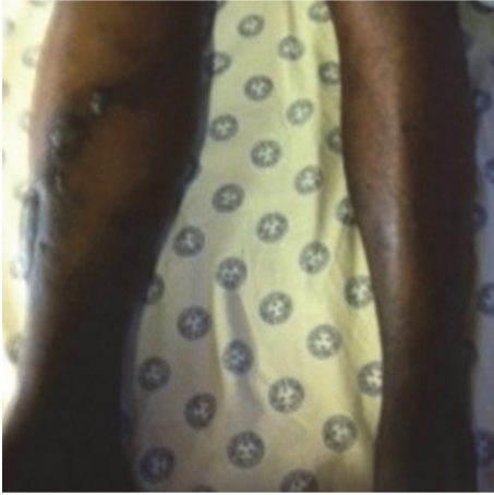
FIGURE 1: The right lower limb was noted to be larger than the left lower limb on arrival to the Emergency Department.