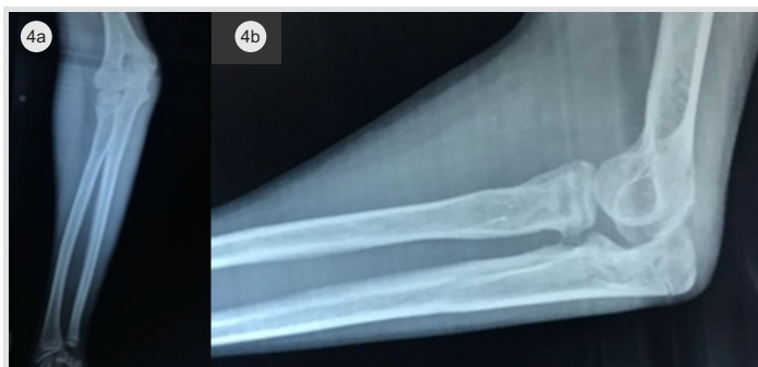
Figure 4: (a) Anteroposterior radiograph of the elbow after 1.5 years of follow-up, (b) lateral radiograph of the elbow after 1.5 years of follow-up.