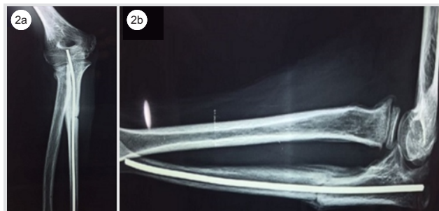
Figure 2: (a) Anteroposterior radiograph of the left elbow after 2.5 months of injury suggestive of well-reduced elbow, anatomic alignment of proximal radius and ulna with an intramedullary nail in situ, (b) lateral radiograph of the left elbow after 2.5 months of injury showing healing of proximal radius - ulna and well-located elbow joint.