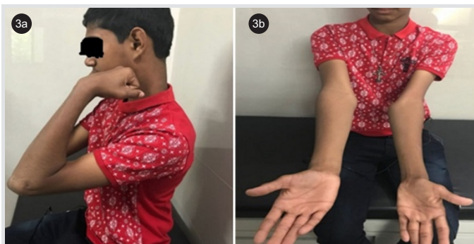
Figure 3: (a) Clinical picture with full flexion of the affected elbow at 1.5 years follow-up, (b) clinical picture with full extension of the affected elbow at 1.5 years follow-up.

To date, <20 cases of convergent elbow dislocation have been reported [5]. Half of them were associated with concomitant fractures of proximal radius, ulna, or humerus, but none of them was associated with the combined proximal ulna and proximal radius fractures. To the best of our knowledge, this is the first case report with these concomitant injuries. Majority of these dislocations had nerve injuries in the form of transient sensory deficit of ulnar nerve. Most common hypothesis suggests that convergent elbow dislocation occurs due to injury over outstretched hand with elbow slightly flexed and hand fully supinated. When elbow is axially loaded in this orientation, tremendous valgus strain is generated leading to rupture of medial ligaments of elbow and compression and shearing stress on radial head and neck region [6]. These forces also lead to fracture of radial neck before rotatory translation and pivoting of the radius in medial position. A report of three cases of convergent elbow dislocation in 2010 postulated that hyperpronation with disruption of annular ligament and brachialis tendon is an injury of necessity for translocation of the radius and ulna to occur [7]. Transposition of proximal radius and ulna