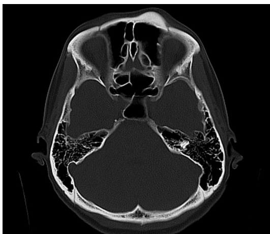
Fig. 2. In the preoperative computed tomography scan, a radio-opaque lesion just medial to the left supraorbital foramen was observed.