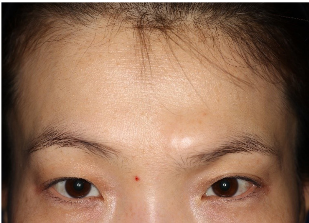
Fig. 1. A 41-year-old female patient presented with a slow-growing, painless mass on her left eyebrow. The mass was 2.5×2 cm in size, firm, round, and hardly movable.

line, just above the hair-bearing area of the left eyebrow (supra-brow incision). The subcutaneous fat, as well as the frontalis and corrugator muscles, was dissected along the direction of the muscle fibers. In the surgical plane deep to the corrugator and superficial to the periosteum, a branch of the supratrochlear nerve was encountered; this was gently turned over using a vessel loop to the lateral aspect. A vertical incision was made in the periosteum, and a 2.5×2-cm osteoma was observed attached to the cortex of the frontal bone. Osteotomy was then performed using a chisel and mallet. The osteoma was extracted in multiple fragments to minimize trauma to the nerve. Contour was compared to that of the contralateral eyebrow and bilateral eyebrows were symmetrical. A postoperative CT scan showed that bone symmetry was adequately achieved (Fig. 3). Postoperative pathological findings were consistent with those