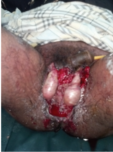
FIGURE 1: Partially debrided Fournier's gangrene.

infection. Diabetes mellitus is reported to be present in 20–70% of patients with FG [4] and chronic alcoholism in 25–50% patients [5]. Any condition with decreased cellular immunity may predispose to the development of Fournier gangrene theoretically. The emergence of HIV into epidemic proportions has opened up a huge population at risk for developing FG [6].