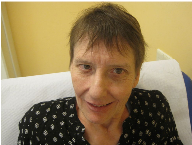
FIGURE 1 Picture of the face of the patient without remarkable dysmorphisms, apart from slight microcephaly

Somatic investigation disclosed a full nasal tip but no other dysmorphisms (Figure 1). Height, weight and head circumference were 157 cm (−2,3 SD ), 53 kg (BMI: 21,5) and 53 cm (−1,3 SD ), respectively. Neuropsychiatric examination revealed autistic behaviors with echolalia and perseverations as well as lack of initiative and low responsiveness. No neurological abnormalities could be detected although absences were regularly observed. No reliable WISC-V scores could be obtained because of floor effects for most subtests. As assessed with the Vineland Adaptive Behavior Scale (De Bildt & Kraijer, 2003), for the factors communication, daily performance and socialization, a developmental age of 5;3, 3;8 and 3;9 (years;months), respectively, was established that were all clearly lower as compared to the results at the age of 56 (6;11, 6;11 and 5;1 year;months, respectively) confirming the observed decline in general functioning over the past years. By using the Dutch Scale for Emotional Development in people with intellectual disability (SEO-R; Claes & Verduyn, 2012), her emotional developmental age was established