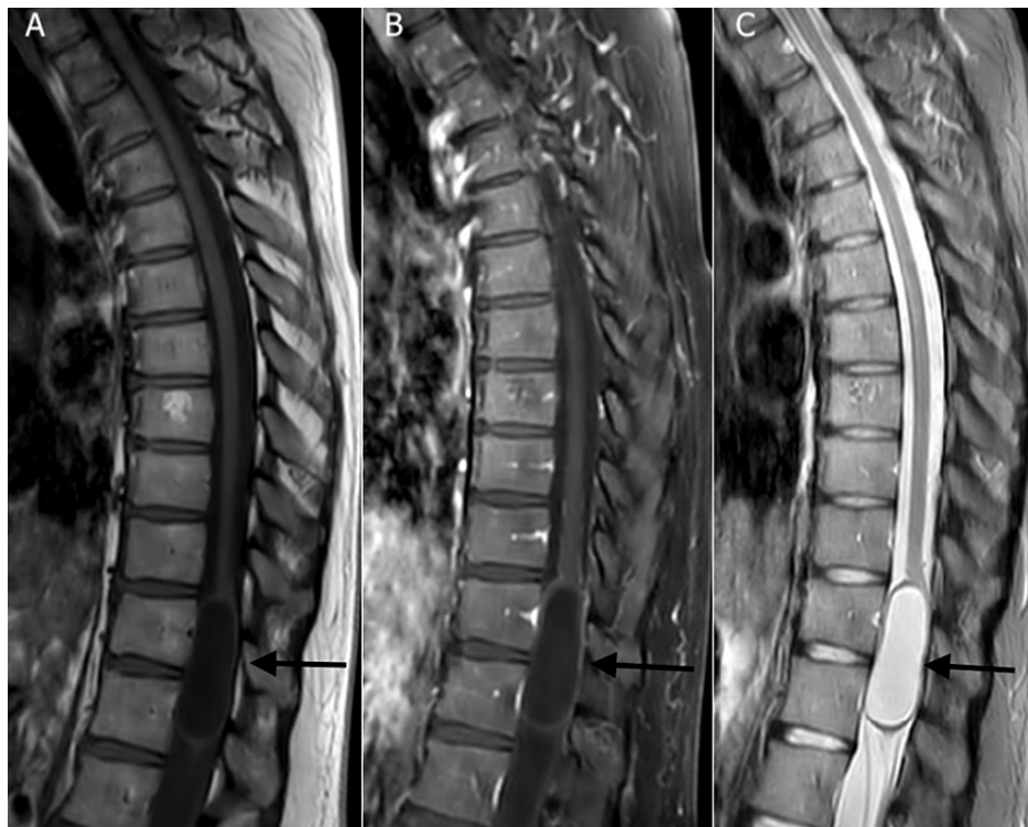
FIGURE 1: Sagittal MRI thoracic spine redemonstrating cystic lesion that has increased in size on follow-up imaging nine years later.

(A) T1 non-contrast sequence; (B) T1 post-contrast; (C) T2.