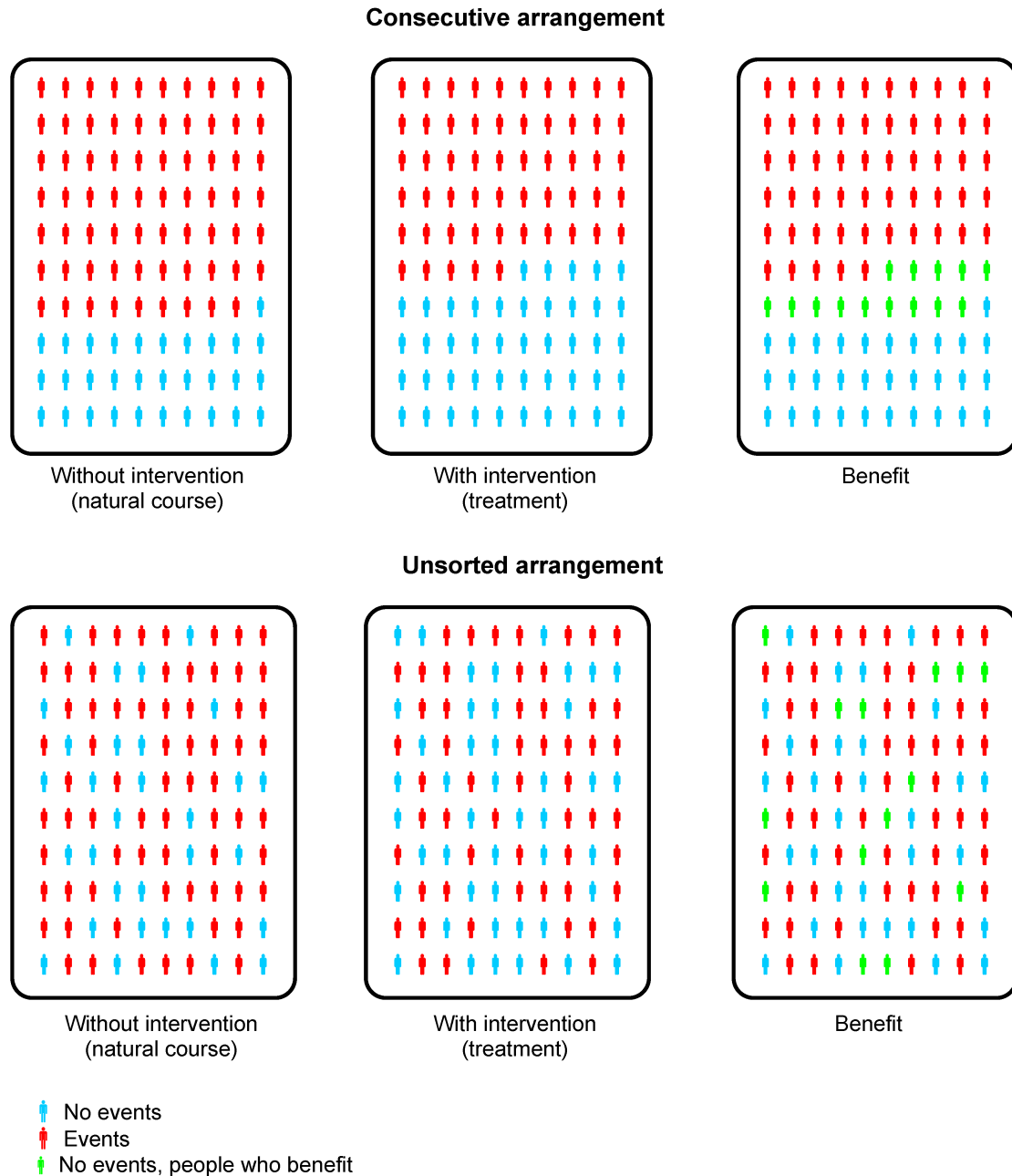
Figure 1: Different formats of 100-figure pictogram illustrations

gather the quantitative information solely from the chart. This proceeding intended to maximize potential differences between the two formats.