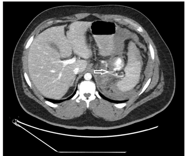
Figure 1. Abdominal CT scan with IV contrast showing a thin neck connecting the splenic artery and the aneurysm.

A contrast-enhanced CT scan of the abdomen and pelvis revealed a 5-cm splenic artery aneurysm at the splenic hilum (Figure 1) with intramural thrombosis and surrounding soft-tissue density, with minimal free fluid (impending