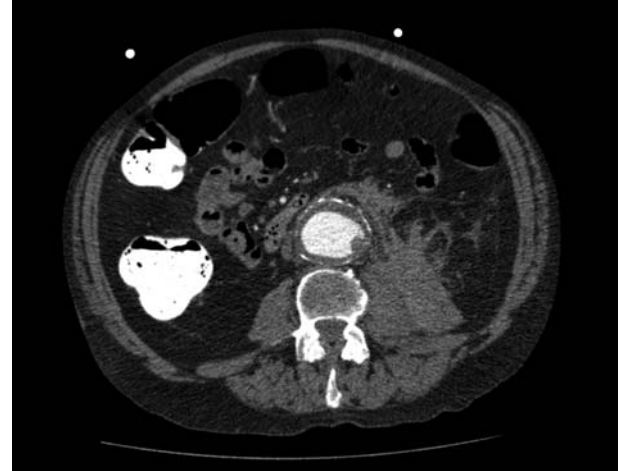
Figure 4: Repeat CT scan of the abdomen, showing evidence of a contained rupture.

pronounced variability of symptoms leads to misdiagnosis and treatment delay.