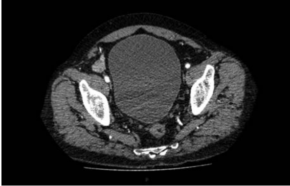
Figure 1: The initial CT scan of the abdomen showing a large distended bladder.