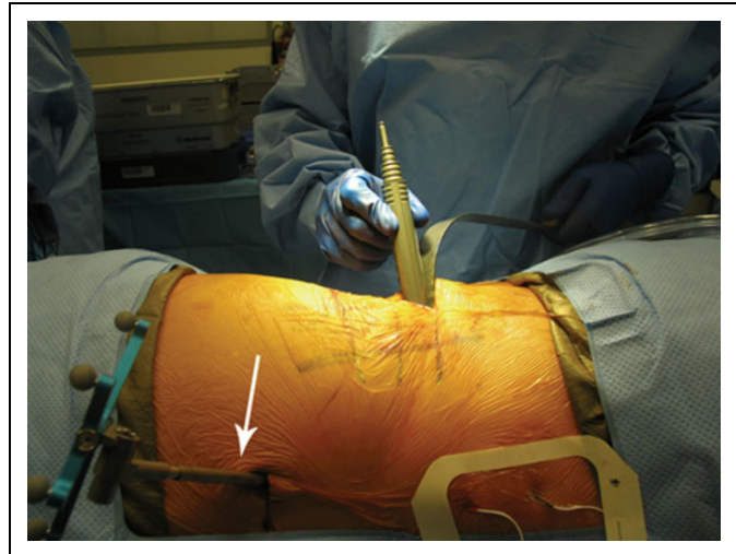
Figure 1. OLIF with navigation reference arc (arrow) on iliac crest.

Demographic characteristics and preoperative variables of the patients are shown in Table 1. Forty-two patients (14 males, 28 females; mean age = 66.4 \pm 7.1 years) underwent OLIF in the treatment of degenerative diseases of the lumbar spine with or without posterior instrumentation. Navigation guidance was used in 22 patients (8 males, 14 females; mean age = 64.4 \pm 6.8 years; range = 58 to 82 years) and conventional fluoroscopy was used in 20 patients (6 males, 14 females; mean age = 68.2 \pm 6.9 years). In the navigation group, comorbidities included chronic obstructive pulmonary disease in 1 patient, diabetes mellitus in 2 patients, and smoking in 5 patients. In the navigation group, the OLIF procedure was performed from 1 to 3 levels for a total of 33 levels with posterior fixation in 19 patients and stand-alone in 3 patients. In the C-ARM group, comorbidities included Parkinson's disease in 1 patient and diabetes in 1 patient. In the fluoroscopy group, the OLIF procedure was performed from 1 to 3 levels for 31 levels