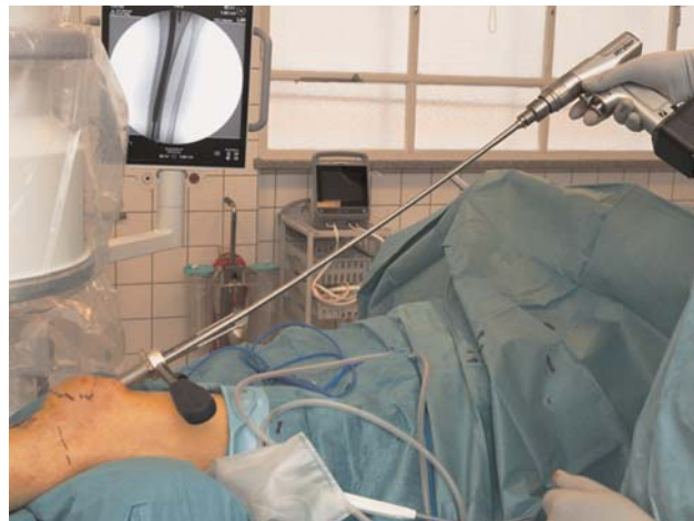
FIGURE 10. Reaming is performed through the drill sleeve as usual, while this is securely fixed to the top of the tibia. There may be a need for extra long reamers. Note the risk of compromising sterility when working close to the anesthesia barrier.

experience in this method of nailing, the soft tissue is exposed to far less intraoperative trauma compared with traditional positioning, and it is possible that the risk of compartment syndrome is thereby reduced. Further advantages of the method are reduced need for an assistant and a shorter operating time.