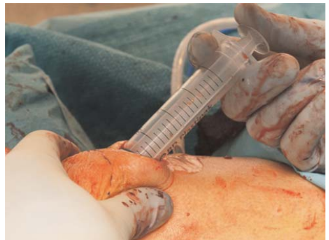
FIGURE 15. Before the end of the operation it is important to flush the knee joint carefully of blood and debris.