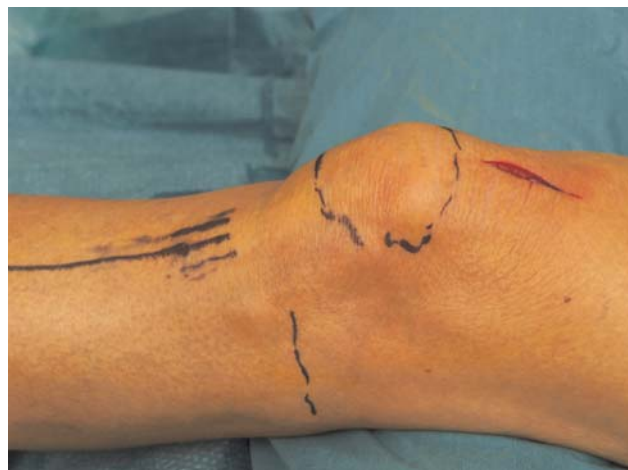
FIGURE 2. Drawing of the midline of the patella and tibia simplifies the subsequent insertion of the guide pin in the top of the tibia. A 1.5-2 cm long skin incision is made 1 cm above the patella.

The ideal entry point seen on anteroposterior view is located 9 mm in the lateral direction from the center of the tibial plateau and slightly lateral to the tibial tubercle (Figures 6 and 7). 5 On the lateral view, the entry point is anterior to the anterior articular margin. In the tibial medullary canal, the guide wire must be directed towards the central position in both planes.