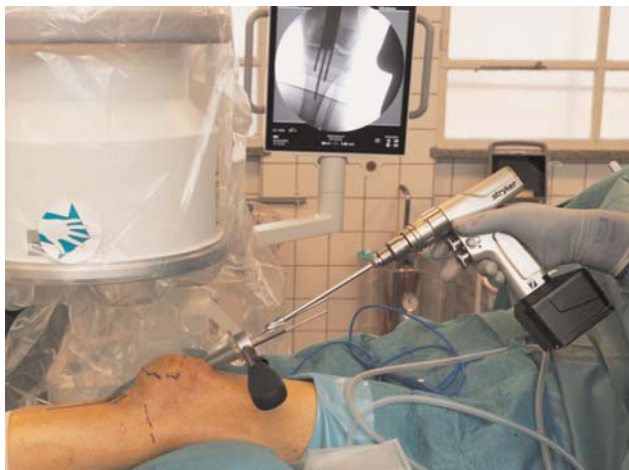
FIGURE 9. With the drill sleeve fixed to the tibia, an opening is made with a short reamer proximally in the tibia.

The main advantages are the simple positioning of the patient and the injured leg, which simplifies reduction of the fracture and the retention of this during nailing. When the leg is positioned stretched on the table, it also is easier to install blocking screws and position the C-arm when the distal screws are to be inserted, with no need for rearrangement. From