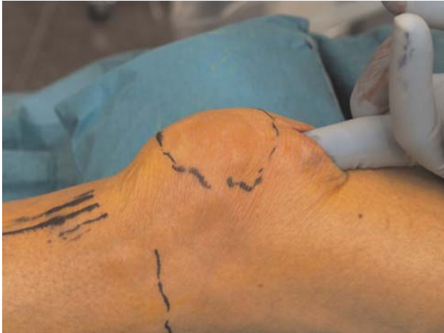
FIGURE 4. A finger should be able to fit easily into the joint below the patella. If it is too tight it can be difficult to instrument the joint and consideration should be given to expanding entry with a partial medial or lateral arthrotomy.

wire is within the medullary canal. In metadiaphyseal fractures, it is important to center the wire in the distal fragment in both the anteroposterior and lateral views.