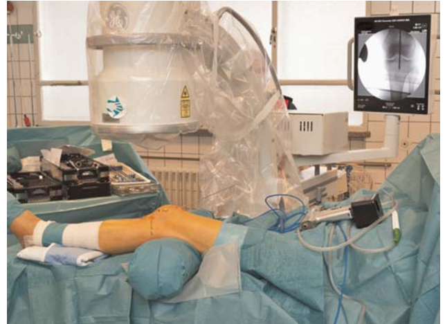
FIGURE 6. Correct placement of the guide wire is checked under fluoroscopy in both planes.

and fix until the nail is inserted. It is essential that the reaming is performed through the protection sleeve (Figure 10), and it is recommended that the correct position of the sleeve is checked radiographically several times during the process to avoid intraarticular damage. Be aware that, depending on the length of the tibia, there will typically be a need to use a reamer at the suprapatellar entry that is longer than the infrapatellar entry. The reaming then takes place as usual to a diameter that is 1 mm to 1.5 mm larger than the diameter of the nail.