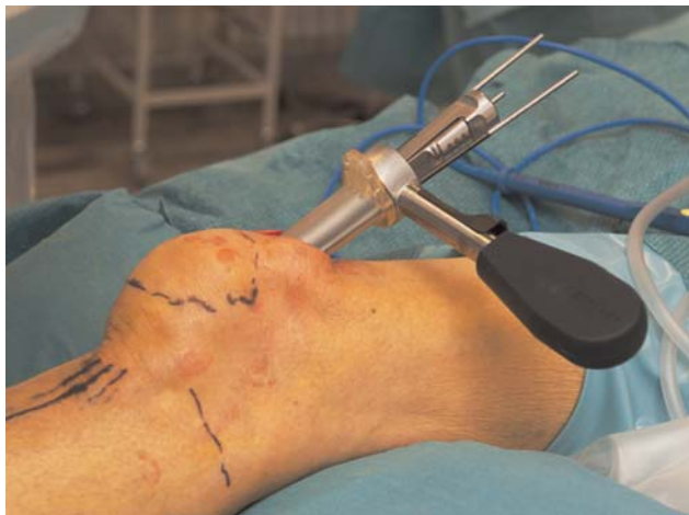
FIGURE 8. The trocar and drill sleeve are inserted along with an elastic nail insertion sleeve over the guide wire. This system allows the simultaneous fixation of the sleeves to the tibia plateau.

knee joint, an additional digital check is made that the nail cannot be felt, and simultaneously the cartilage on the patella and the femur can be checked for damage (Figure 14). The knee joint is flushed with saline to ensure that debris and blood is removed from the joint (Figure 15).