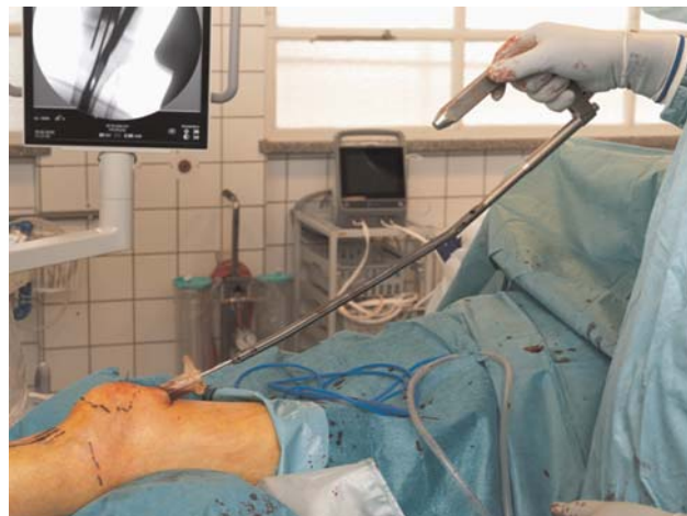
FIGURE 11. The nail is placed into the tibia over the guide wire and through the elastic nail insertion sleeve.

Concerns over the use of SPN include entry through a healthy knee joint and the risk of inflicting damage to the knee joint and, at worst, causing an infection in the joint. Despite this, today many retrograde femoral nailings and arthroscopies of the knee joint are performed without the same concerns. Jakma et al. 3 operated on seven patients with SPN, four of whom had arthroscopy performed before or after nailing. In spite of the fact that unreamed nails were inserted and only the thinnest reamers were used to open proximally all showed signs of cartilage damage. 3 In Tornetta and Collins' 1 original series of 25 patients, one patient developed postoperative hemarthrosis, and two patients had minor cartilage abrasion. 1 Later Ryan and Tornetta 6 modified the method by nailing with the knee joint in 20-30 degrees flexion, changing the surgical