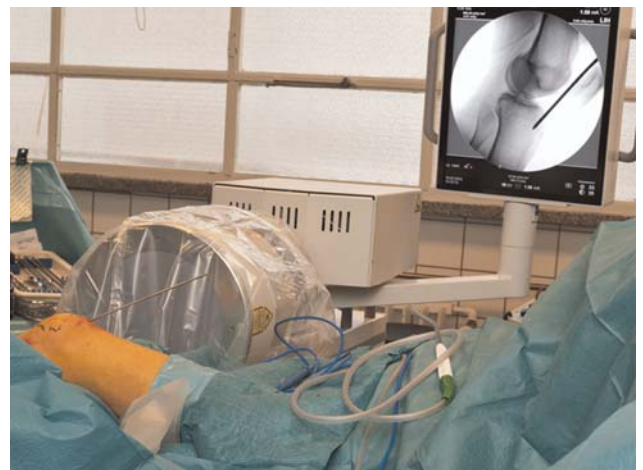
FIGURE 7. Correct placement of the guide wire.

A proper end cap is inserted (Figure 13), and under fluoroscopy it is then ensured in both planes that the nail does not protrude into the knee joint. With a finger in the