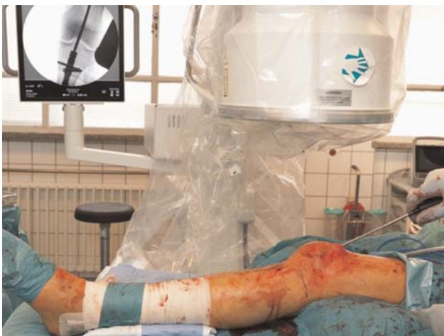
FIGURE 13. The end cap is inserted.

A major side effect of tibial nailing is anterior knee pain, with a mean incidence of 47% after 2 yr. 9 The reasons for knee pain remain unknown, but it is reasonable to assume that surgical entry by nailing may be of importance. A retrospective study comparing SPN with standard nailing found no differences in the level pain. 6 In a study of 37 patients operated with SPN