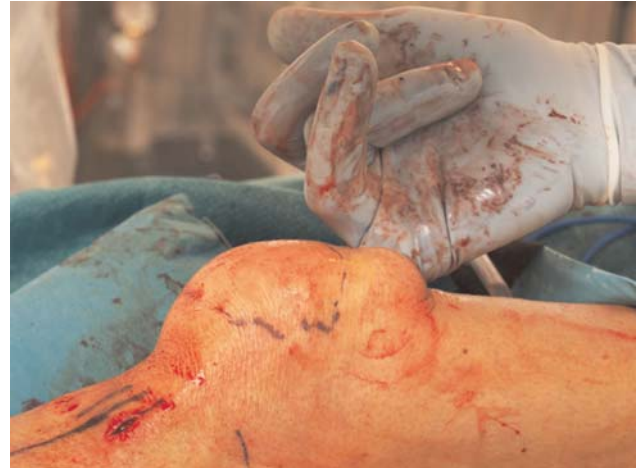
FIGURE 14. With a finger in the knee joint, the patella and femur are inspected for damage, and a final check is performed to make sure the nail cannot be felt inside the knee joint.

In cadaver studies that examined the risk of intraarticular damage by the traditional infrapatellar entry, injury to the medial meniscus and the intermeniscal ligament has primarily been reported, but with less damage to the lateral meniscus and the footprint of the anterior cruciate ligament (ACL). 5 Cadaver studies examining the injuries after nailing through a supra-