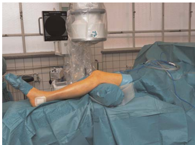
FIGURE 1. Patient is positioned supine with a roll under the knee joint, which is bent 20-30 degrees. If the healthy leg is lowered from the horizontal position, the C-arm can be brought easily into position for a lateral view without moving the damaged leg.

The patient is positioned supine on a radiolucent table (Figure 1), and the injured leg is positioned with a roll under the knee joint so that it is flexed 20-30 degrees. The C-arm is placed on the opposite side, and if the table allows split leg, the healthy leg is lowered 20-30 degrees from the horizontal position; the C-arm ensures optimal imaging in both anteroposterior and lateral views with no further movement of the injured leg.