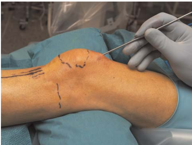
FIGURE 5. The guide wire is introduced into the knee joint and is placed on top of the tibia. If it is aimed at the drawn midline of the tibia, placing the guide wire correctly at the first attempt often is successful.

Before reaming, the fracture is reduced in the usual manner. A percutaneous reduction clamp might be useful in reducing oblique fractures to an anatomic or near-anatomic position during the reaming process. Positioning with the legs stretched makes it much simpler to reposition