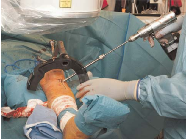
FIGURE 12. The nail is proximally locked using the system's targeting device.

entry to a smaller incision of 3-5 cm from the middle to the upper part of the patella, and performing the medial arthrotomy covering only the upper part of the retinaculum and 1-2 cm into the quadriceps tendon. 6 Several manufacturers have now developed equipment for SPN in which protection sleeves protect against intraarticular damage. Sanders et al. 7 operated on 55 patients with T2 (Stryker, Kalamazoo, MI) and Trigen (Smith and Nephew, Memphis, TN) nails with the suprapatellar approach. In 13 of 15 patients, arthroscopy was performed before and after nailing, and no cartilage changes were seen. One year after surgery, 33 patients had MRI performed with respect to cartilage damage, one had grade II patellofemoral changes and one had grade III changes, but there was no correlation between the arthroscopic changes, MRI scans, or the clinical examination.