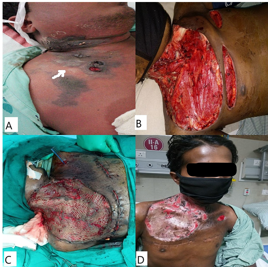
FIGURE 2: Clinical image.

A: clinical image showing necrotizing skin lesion over the neck and chest wall. B: post-debridement image. C: split-thickness skin graft application. D: follow-up 15 days after discharge.