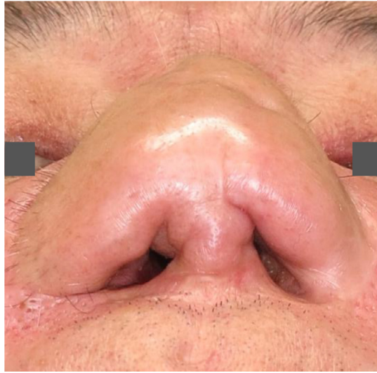
Figure 4. Twenty-five months after secondary reconstruction. The nasal airway was maintained.

An intranasal stent was used postoperatively for five months to prevent restenosis. The nasal airway was maintained 25 months postoperatively (Figure 4). Although it was ideal to perform additional surgery to improve the nasal morphology, the patient did not want further surgery because he was satisfied with his nasal breathing condition. His mouth dryness also improved.