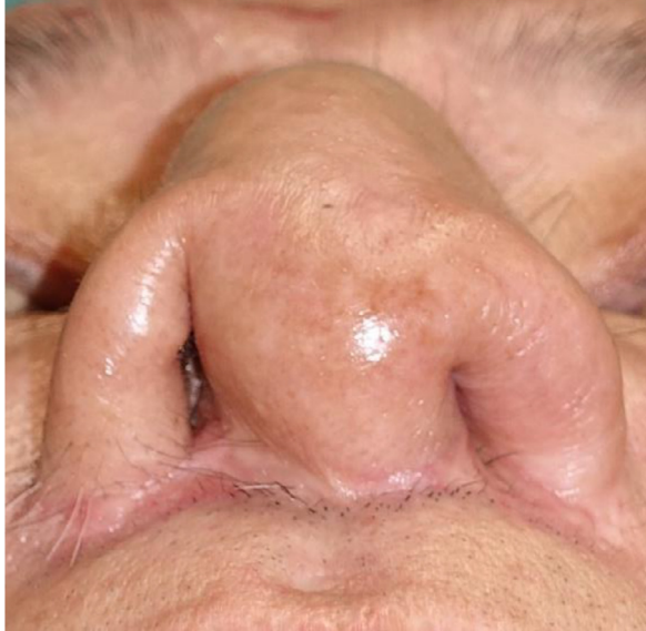
Figure 2. Six months after flap division. Nasal vestibular stenosis was observed.