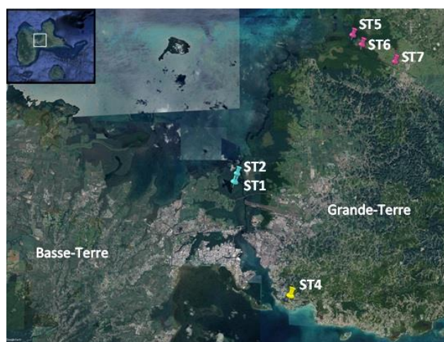
Figure 1. Google map showing the collection sites (ST: stations) located in Grande-Terre (ST4, ST5, ST6, and ST7) and in Basse-Terre (ST1 and ST2), the two main islands constituting Guadeloupe.

A total of 20 cyanobacterial strains were successfully isolated, and grown from green biofilms collected from distinct locations in Guadeloupe, namely the Manche-à-Eau lagoon close to red mangrove trees (two stations ST1 and ST2 and five strains), the Marina Bas-du-Fort (one station ST4, one strain), and the Canal Des Rotours (three stations ST5, ST6, and ST7 and 14 strains, Figure 1 and Table 1). Biofilms were found either covering the sediment surface, attached to immersed roots of mangrove trees, or attached to sunken deadwood.