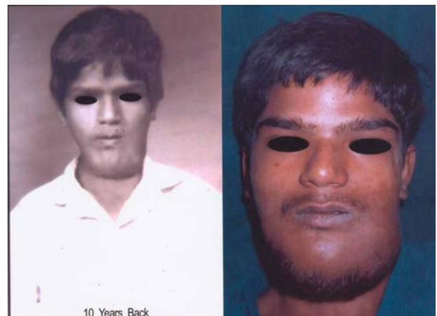
Figure 1 Extraoral photograph taken 10 years back and at present.

The blood picture was normal except for increased ESR (60/mm 1st hr). Orthopantomograph and lateral cephalogram revealed soft tissue shadow with no bony involvement. Computed tomography showed non homogenous mass of soft tissue density in the buccal aspect with no evidence of bone destruction which gave an impression of benign non-enhancing lesion of soft tissue mass. A provisional diagnosis of haemangioma was made with differential diagnosis of lymphangioma and rhabdomyoma.