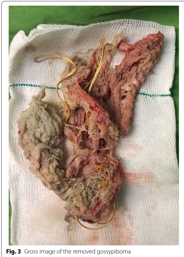
Fig. 3 Gross image of the removed gossypiboma

in 1884 as ‘a cotton sponge left in a patient’s abdomen’ [5]. In a recent study, Gulsen et al. [5] reviewed the cases of intrathoracic gossypiboma. The time from the surgery to diagnosis ranged from 3 weeks to 52 years [1, 5]. Our case was diagnosed approximately 47 years after the initial surgery. Most patients with intrathoracic gossypiboma are symptomatic, presenting with chronic cough, shortness of breath, chest pain, fever and weight loss. There are also a few cases of asymptomatic gossypiboma [5]. Typical presentation and typical radiological findings narrowed our differential diagnosis. However, this is not the case in all cases of intrathoracic gossypiboma. Gossypiboma can be misdiagnosed as hematoma [6], bronchiectasis [7], malignancy [8], aspergilloma [9], hydatid cyst [10], and empyema [5]. The most frequent location of gossypibomas is the abdomen. Nonetheless, they could be less frequently found in the pelvis or thorax, as in our case [11]. Obesity, emergency surgeries, and improper counting of materials at the end of procedures are associated with an increased risk of gossypibomas [12]. However, none of these were present in our case.