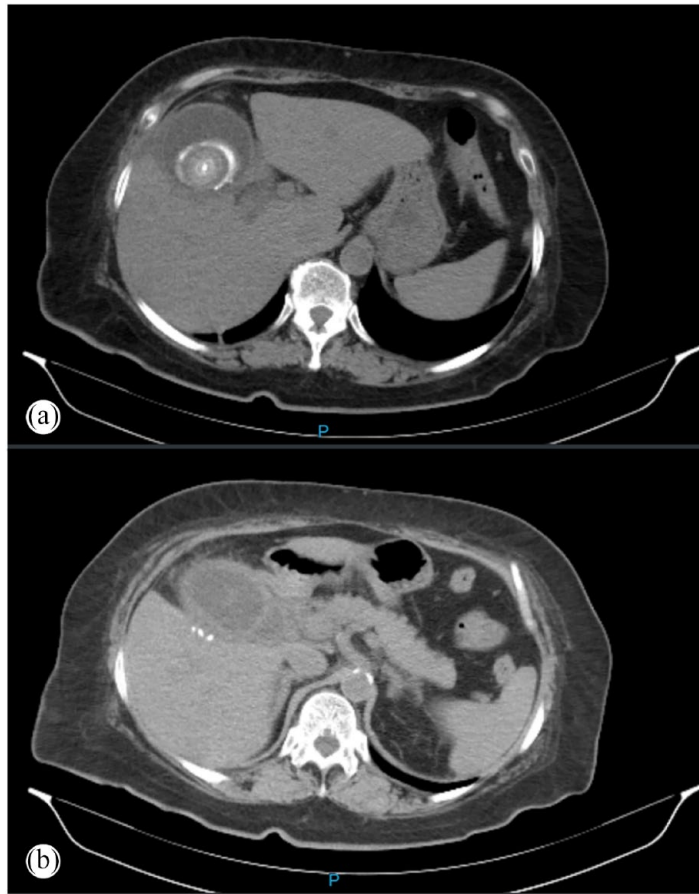
Figure 1. (a) Axial view of the abdominal CT at level of T12 vertebrae, showing an enlarged gallbladder filled with large amounts of fluid, with marked diffuse uniform wall thickening and a hyperdense gallstone partially obstructing the gallbladder neck. (b) Axial view of the abdominal CT at level of L1 vertebrae showing enlarged gallbladder with wall edema and pericholecystic fluid. CT, computed tomography.