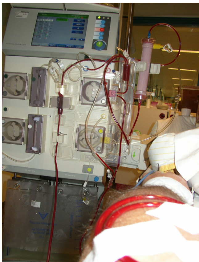
Figure 2 patient connected to hemofiltration machine.

thrombosis and stenosis [5]. Although a rising number of ICUs will use extra corporal citrate anticoagulation in unstable patients at risk for bleeding, many dialysis centers still use unfractionated heparine in those cases. The controle of heparinization (usually 2 \times normal value of aPTT) and reversibility of heparine overdose (protamine sulfate) are important potential advantages. Moreover, heparine given by the dialysis line may produce a higher local (femoral vein) heparine concentration with concurrent improved prevention of femoral/iliac vein thrombosis when compared to subcutaneous application of low molecular weight heparin analogues. Besides side-effects related to central venous catheters [6], obtaining or maintaining vascular access for continuous hemofiltration can sometimes be problematic, especially in the child or adult in multiple organ failure with edema and/or coagulopathy [7]. Ultrasound guidance for cannulation of the internal jugular and subclavian veins may be used. Nevertheless, common access problems include obstruction of the femoral, subclavian, or jugular veins due to previous thrombosis, insertion difficulties, safety concerns when cannulating the subclavian vein in coagulop-