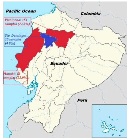
Figure 2. Map of Ecuador marked by provinces where the sampling was carried out.

20–35 °C, 82–90% humidity, and 150–300 m above sea level), and 10 (4.8%) from Santo Domingo de los Tsáchilas (temperature between 21–32 °C, 80–90% humidity, and 150–300 m above sea level). One hundred and eleven samples (53.1%) were collected during the rainy season (April and November) and 98 samples (46.9%) in the dry season (June and August) of 2019.