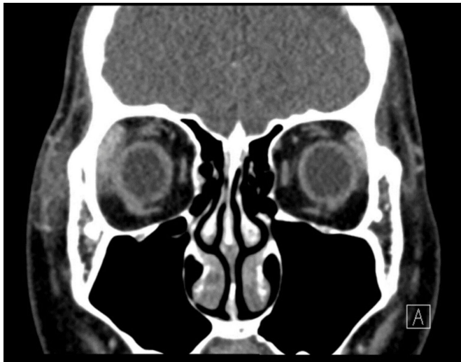
Figure 2 Coronal CT scan. Enlargement of the right lacrimal gland and lateral rectus with associated preseptal and eyelid oedema.

movements were now full. Intravenous antibiotics were discontinued. The prednisone dose was tapered to zero over 2 weeks. The patient subsequently declined his second COVID-19 immunisation.