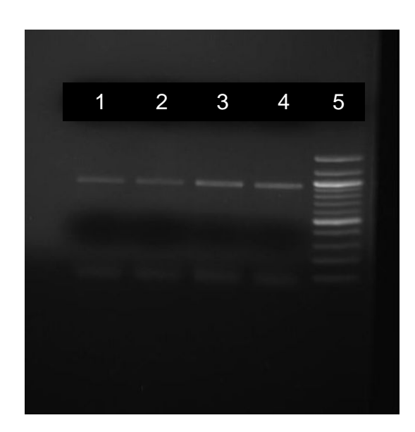
Fig.2: PCR products of the CP5 gene by using the designed primers, lane 1-3: Isolated samples revealed as E. histolytica , lane 4: standard species of E. histolytica (HM1), lane 5: DNA ladder 100 bp