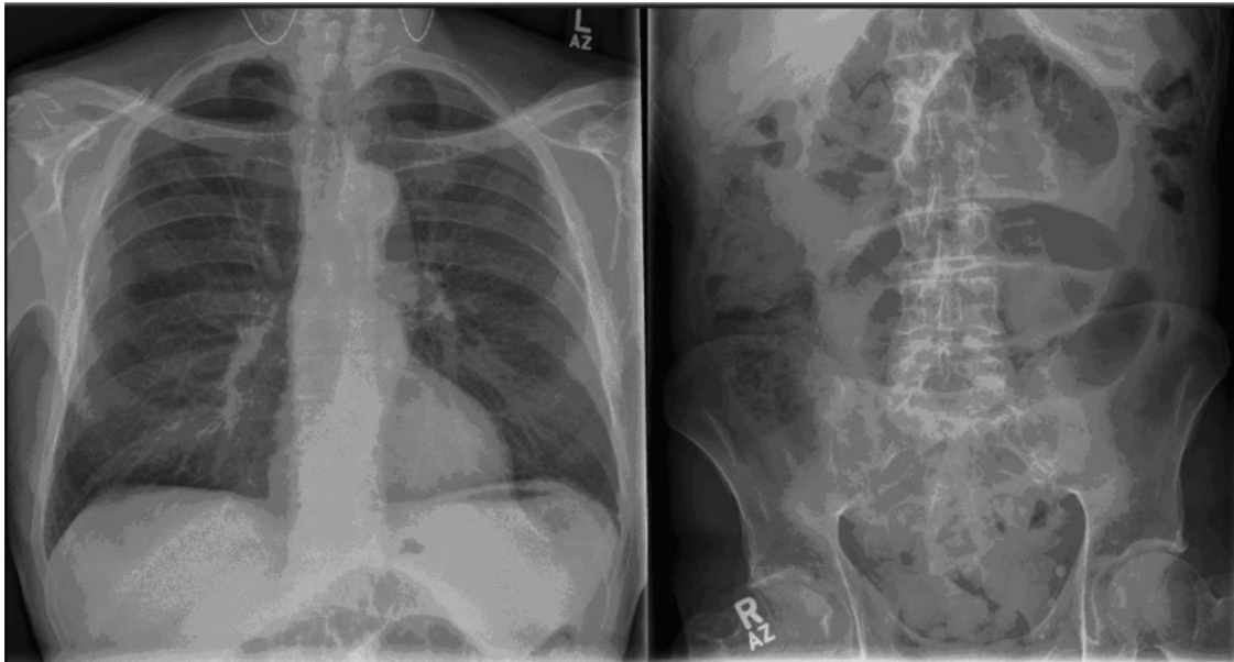
Figure 1: Plain film of the chest and abdomen: the chest X-ray shows features suggestive of air under the diaphragm, while the abdominal film shows dilated loops of small and large bowel with air in the rectum, highly suggestive of ileus.