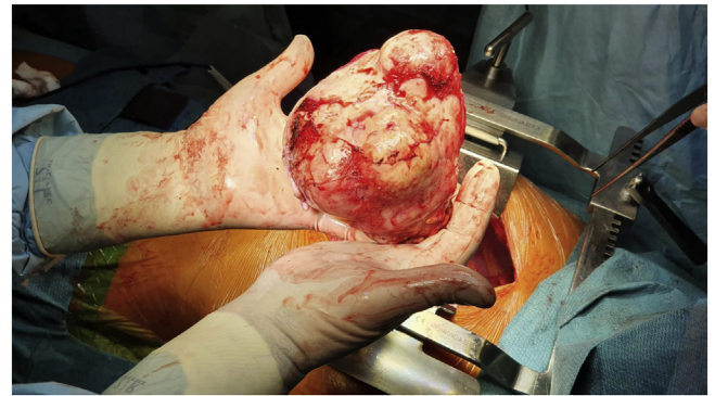
Fig. 3. En-block tumour resected from the right thoracic cavity.

with the consent of all specialists, was then advised for urgent surgery performed by cardiac surgeons. Following median sternotomy, the tumour was observed in the anterior mediastinum and was tightly adherent to the surface of the right middle and lower lung lobe, and the pericardium. The patient underwent a mediastinal tumour excision and thymectomy. The mass was attached to the pericardium, however, there was no need to proceed with pericardiectomy as the tumour did not penetrate the pericardium and was easy to dissect. There were no visible invasions of adjacent structures. The mass en-block excision and thymectomy revealed a well-defined tumour with a maximum diameter of 10 cm (Fig. 3). The postoperative course was uneventful, and the symptoms totally resolved. Histopathology revealed a mature mediastinal teratoma (60%) with somatic type malignancy (40%) including neuroblastoma and intestinal type of adenocarcinoma. There was no evidence of invasion outside the tumour capsule, and the operation was classified as R0. The patient was referred to the oncology centre for further evaluation. Positron emission tomography (PET) did not reveal any suspicious areas of enhanced metabolic activity. The most common laboratory tumour markers were all negative. At 3 months follow-up, she returned to her former physical fitness and sports activity, without any signs of disease.