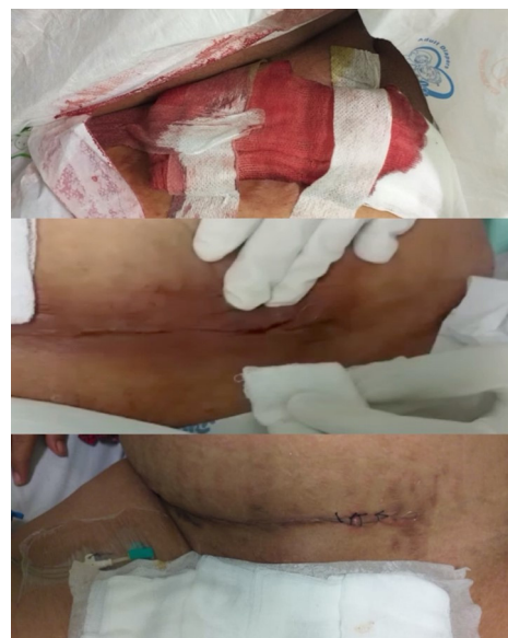
Figure 3 Surgical wound bleeding was caused as an adverse effect of heparin therapy. The gauze was soaked in blood on day 11 of admission (D11) (top). The source of bleeding from the wound incision detected on D11 is seen here (middle). The incision was resutured, and the bleeding stopped after cessation of heparin therapy on day 15 (bottom).

changed to levofloxacin 750 mg once a day and ciprofloxacin 200 mg once a day. The patient's condition improved during the next several days. On D24, the patient had stable vital signs: normal BP (126/73 mm Hg) and good saturation with O 2 from nasal prongs (95%–96%), and the incisional wound had healed. The patient was discharged on the next day (D25). The timeline of this case is shown in figure 4 .