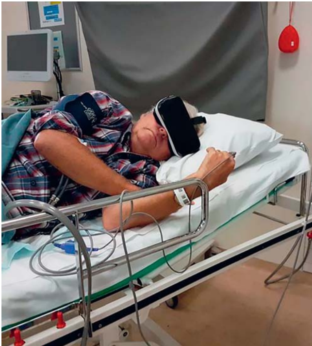
► Fig. 2 Samsung Gear VR shown on a patient during colonoscopy (with permission).

(► Fig. 2 ). No adverse events associated with VR distraction in combination with medication were observed. One endoscopist performed all the procedures (FV) except one in the VR group (BvH). FV had >5 years of experience, BvH >3 years.