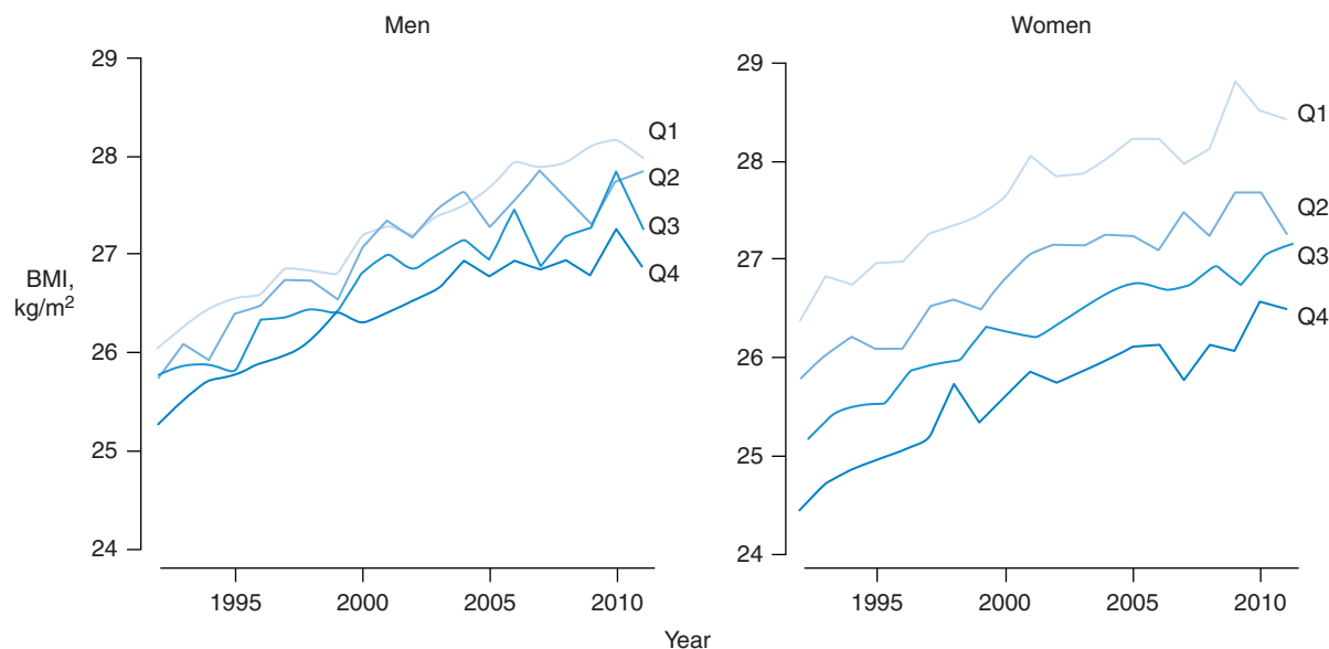
Fig. 1 English mean BMI by height quartile from 1992 to 2011. Left: men; right: women. Q1 to Q4 as Quartile 1 (shortest) to Quartile 4 (tallest).