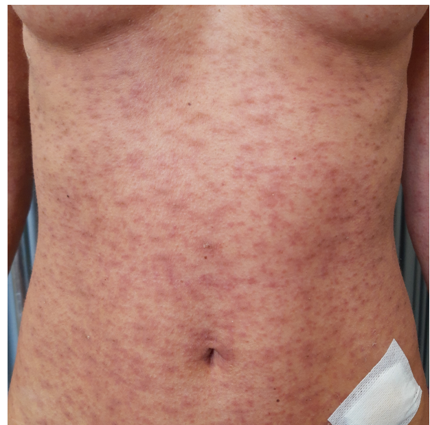
Figure 1 Lymphomatoid drug reaction. Erythematous papular lesions partially covered by sero-hematic crusts, clinically resembling pityriasis lichenoides et varioliformis acuta, are appreciated on the trunk of a 31-year-old female subject.

A 31-year-old Caucasian woman presented with an acute generalized rash arising 10 days after the first dose of BNT162b2 (Comirnaty, Pfizer/BioNTech), which was mildly itchy and associated with fatigue. No reactions at the site of injection and no systemic symptoms, such as fever, were reported. The patient denied taking any medication prior to the eruption. Past and recent medical history was uneventful. Skin examination showed erythematous-pinkish papular lesions partially covered by sero-hematic crusts, involving the trunk, the arms, legs and the face (Fig. 1). The mucous membranes were apparently spared. Bilateral inguinal lymphadenopathy was appreciated at physical examination. The evaluation of serum inflammatory markers, liver and renal function tests, vasculitis-specific antibodies and other markers of autoimmunity was unremarkable. Blood tests for viral and bacterial infections were also negative. The diagnostic workup was completed by skin histologic and immunohistochemical studies: the histopathologic findings were hyperkeratosis producing scaling and crusting. There was reactive epidermal hyperplasia, diffuse spongiosis with foci of mixed, lympho-monocytic infiltrates, as well as the presence of Langerhans cells and granulocytes. The superficial and medium dermis were also involved with a dense, polymorphic inflammatory