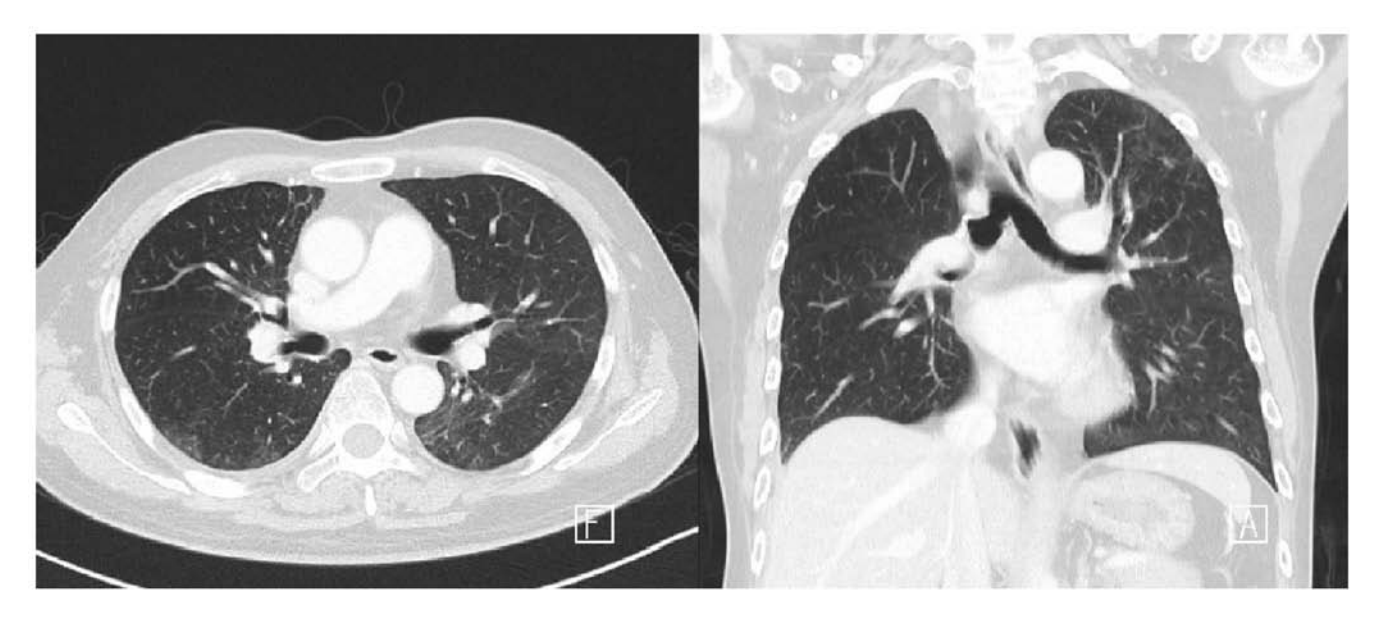
Figure 2. Chest computed tomography images. Marked regressive changes were observed in the bilateral ground-glass opacity previously exhibited by the patient (arrows).

and optimal management of this rare but serious side effect of capmatinib treatment.