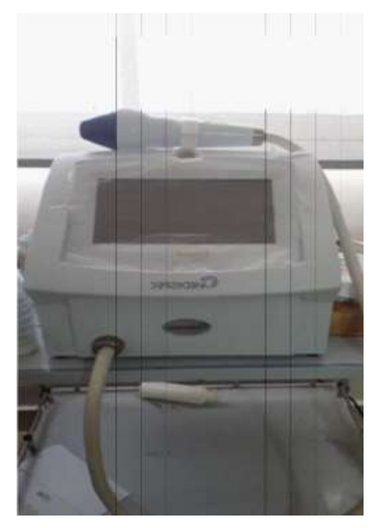
Figure 2: picture of the shockwave machine used for this study

None of the patients reported any pain or adverse events during the treatment and follow up period.