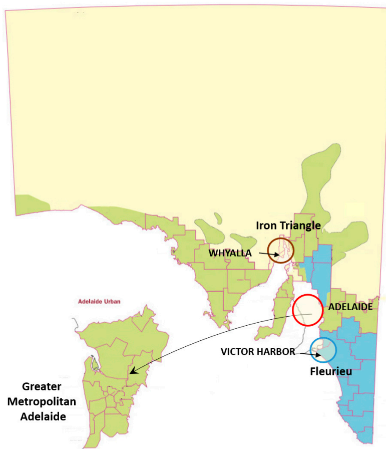
Figure 1. Climate zones in South Australia and the three study regions: Iron Triangle BSk; Adelaide Csa; Fleurieu Csb [51].