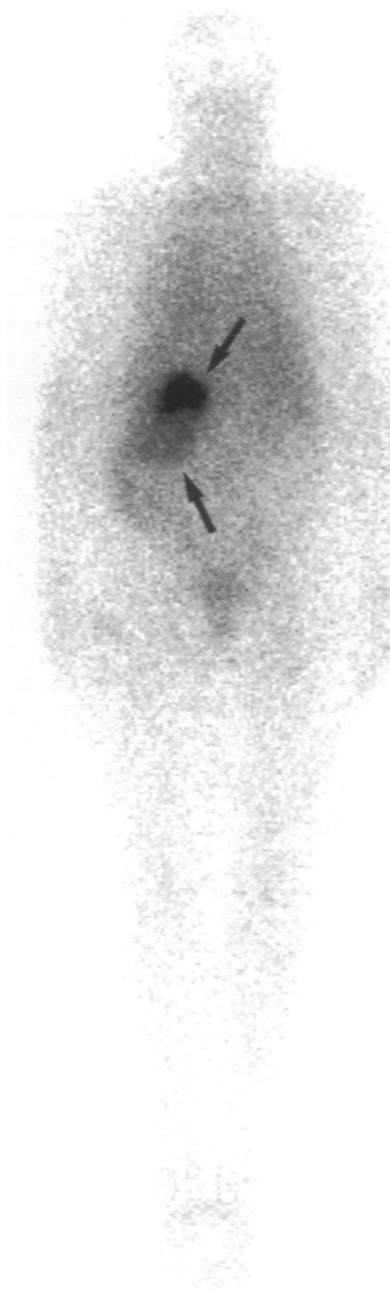
Figure 2 Whole-body radioimmunoscintigram (posterior view). Arrows, primary tumour (no. 1) of the left kidney. In the upper pole an area with high [ ^{131}\text{I} ]cG250 uptake is visible, whereas the mid- and lower pole show much less [ ^{131}\text{I} ]cG250 uptake

Analysis of the uptake of [ ^{131}\text{I} ]cG250 in the tumour samples revealed a highly heterogeneous distribution of the antibody in two of the four tumour slices analysed. In some cases measured differences in uptake of [ ^{131}\text{I} ]cG250 in the tumour samples exceeded a factor 100 (tumour 1). Both patients with tumours showing a heterogeneous [ ^{131}\text{I} ]cG250 distribution received a relatively low amount of MAb cG250 (5 and 10 mg), whereas the other two patients received a high amount of MAb cG250 (50 mg). As has been observed with murine G250 (Oosterwijk et al. 1993), tumour saturation may occur at higher protein dose levels ( \geq 25 mg). Saturation of G250 epitopes on tumour cells leads to a more homogeneous distribution but inevitably also to a lower uptake in terms of % ID \text{g}^{-1} (Steffens et al. 1997). An overview of the ranges in cG250 tumour uptake in all tumours is shown in Table 1. As illustrated by the reconstructed image of one of the tumor slices,