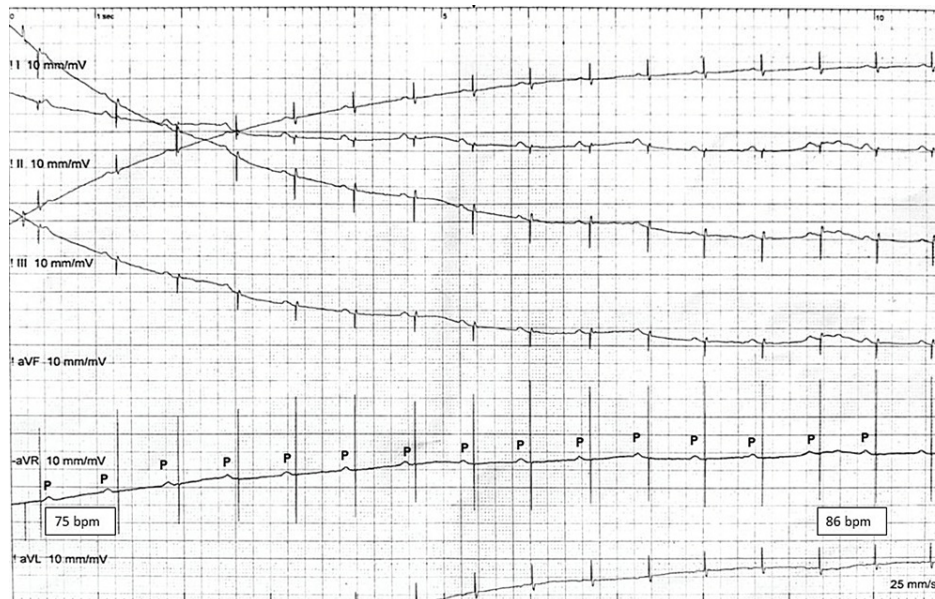
FIGURE 2: Six-Lead Electrocardiogram

Six-lead rhythm strip that shows atrial sensing, followed by a unipolar pacing spike and appropriate ventricular pacing. There is an application of electrocautery (EC) for a period of 3.2 seconds and then an abrupt failure to pace. The first beat after the application of EC (star) is possibly a tracked-paced beat. After EC cessation, the first two P waves (P1 and P2) are not sensed. There are atrial and ventricular pacing spikes without evoked potentials (failure to pace). Onward from P4, there is appropriate atrial sensing then the programmed AV delay and unipolar ventricular pacing spikes, but no ventricular evoked potential (failure to pace), which remains for the duration of the trace.