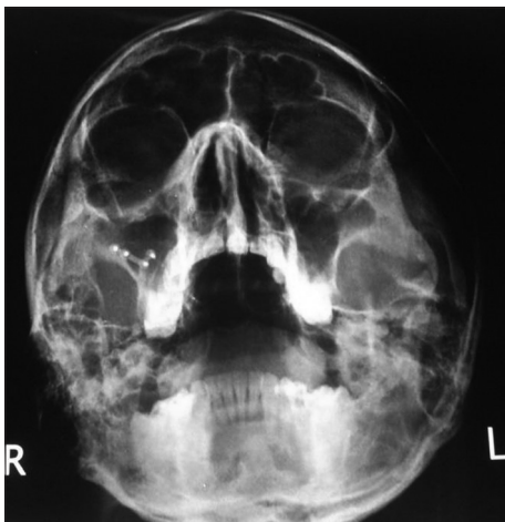
Figure 6: PNS view postoperative

The injury to the left side of the face showed more predominance in our study, this could be due to