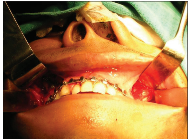
Figure 3: Fixation of fractures by titanium plate on right side and bioresorbable on left side

All the patients were advised to apply ice pack extra orally to reduce swelling. No postoperative maxillomandibular fixation was used and the patients were immediately placed on a liquid diet for the first 2 days postoperatively; semisolid diet was started on 3 rd day and normal diet thereafter. The skin sutures were removed on the 7 th postoperative day. In all patients, follow-up was done at immediate postoperative, at interval of 3 months postoperative and 6 months postoperative [Figures 5 and 6].