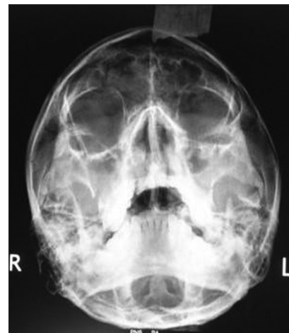
Figure 2: Bilateral zygomatic complex fracture pre operative PNS view