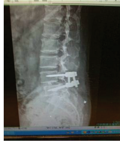
FIGURE 2: Postoperative image after miniopen TLIF.

were included in this study if they (1) had degenerative discopathy or spinal instability, (2) had no previous lumbar-spine surgery, and (3) had undergone single-level fusion.