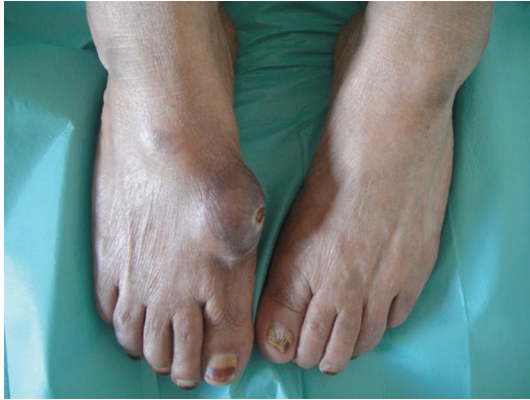
FIGURE 1: Large mass on the dorsal surface of the right foot of a 60 year-old woman.