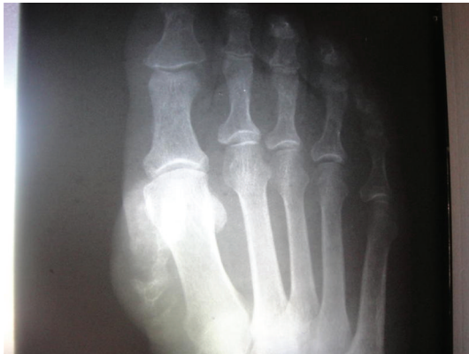
FIGURE 2: Radiograph showing soft tissue mass with calcification.

in the palms and soles of the children [1]. Although less well known, CAF can also occur in a wide variety of other less common locations. A review of the literature shows 45 cases affecting unusual sites such as the back, forearm, knee region, and thigh. In our knowledge, our case is the first one with a CAF in the dorsal surface of the foot. It seems to have a male predominance, particularly in children and young adults, with a peak incidence at ages 8–14 years [2, 3]. The aetiology of the tumour is uncertain [1]. The lesion typically ranges in size from 1 to 5 cm, and is often present for years before removal, owing to its indolent growth characteristics [2]. Radiologically, CAF may show a soft tissue mass with no associated osseous lesions and a fine stippling of focal calcification [4]. However, in extremely rare cases, occasional scalloping of the cortex [5, 6] and thickening of the bone [7] have been reported in pediatric patients.