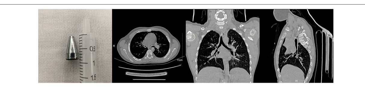
FIGURE 1 | A stand of a pen in the right main stem bronchus of a nine-year-old boy.