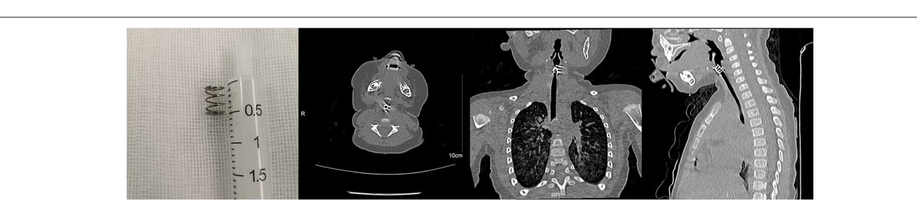
FIGURE 3 | A spring in the glottis of a nine-month-old boy.